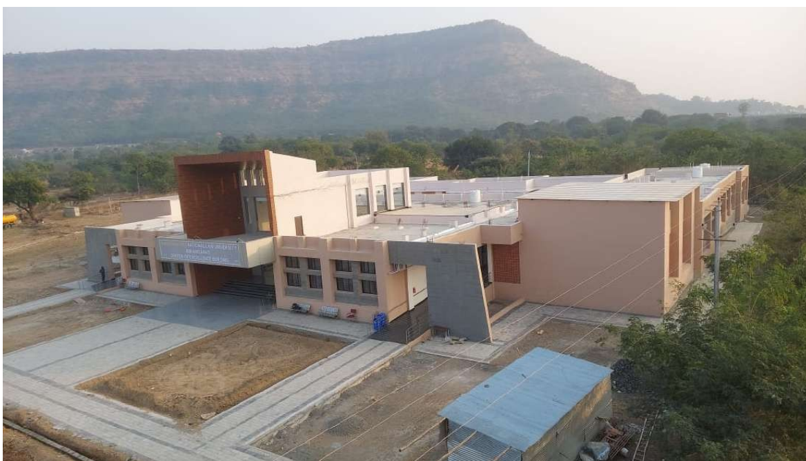
"Centre of Excellence" Building of the University