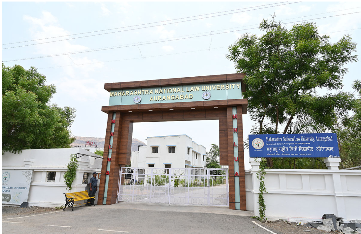
The main Gate of the Maharashtra National Law University Aurangabad Campus